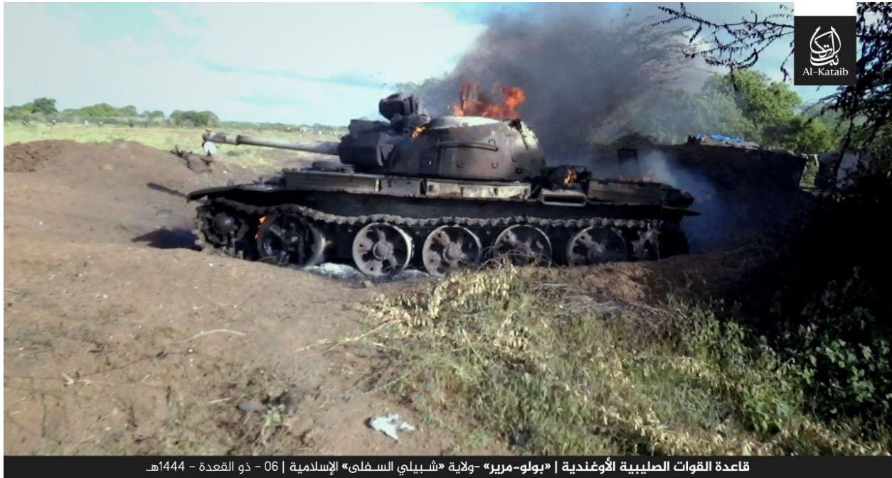
قاعدة القوات الصليبية الأوغندية | «بولو-مريير» -ولاية «شيبلي السفلى» الإسلامية | 06 - ذو القعدة - 1444هـ.

The attack followed a well-known pattern in Al-Shabaab's attacks against military bases in Somalia. First, a VBIED detonated in the main gate of the base, and then dozens of militants, equipped with small arms, RPGs and supported by mortar and machine gun fire stormed the base.