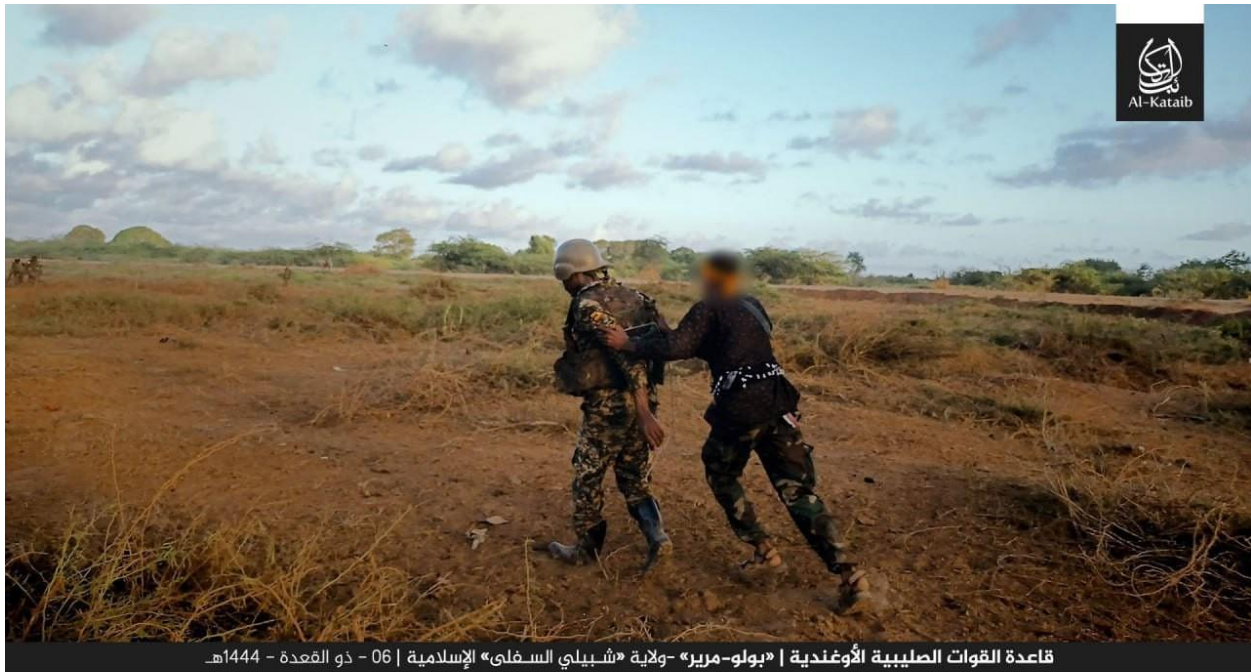
UGANDAN CRUSADERS' MILITARY BASE | BUULA-MAREER - THE ISLAMIC WILAAAYAH OF LOWER SHABELLE | 26 - MAY- 2023

A number of Ugandan soldiers were also captured by Al-Shabaab militants as evidenced by footage released by Al-Shabab's media arm, Al Kataib Foundation, which used the opportunity for its publicity campaign.